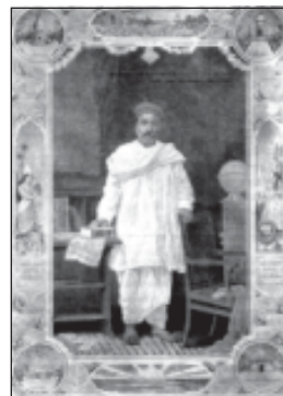
Figure – 4