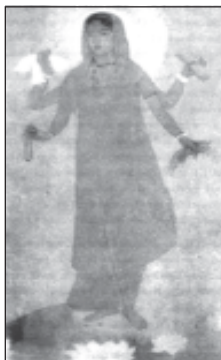
Figure – 2